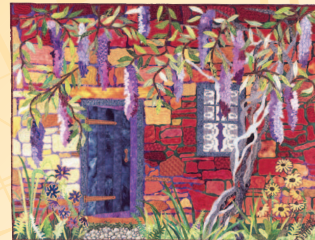
Mi Casa, Su Casa by Grace Errea